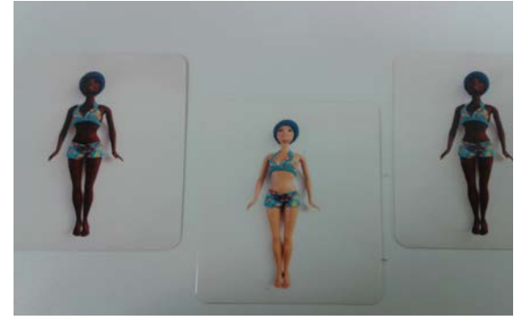
Figure 1: Condition 4

We tested 24 5-7-year old Euro-American children. In each of four conditions, children viewed photographs of three dolls (gender-matched to the participant) arranged side by side with no relationship given (See Figure 1). Children rated the middle doll on six dimensions including 1) attractiveness, 2) intelligence, 3) niceness, 4) wealth, 5) popularity, and 6) the extent that they would want to be friends with this doll. Children rated the doll on each dimension using a "liking line", with lower numbers indicating less liking (or lower ratings) and higher numbers indicating more liking (or higher ratings). In various orders, children evaluated a white doll paired with two identical white dolls (Condition 1); a white doll paired with two identical black dolls (Condition 2); a black doll paired with two identical white